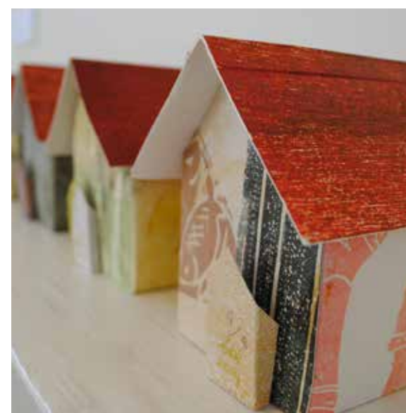
Image above Hunter Island Press Image right Jess Fodor, Entomophagy , 2021