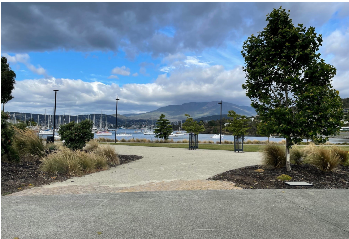
Proposed artwork location.