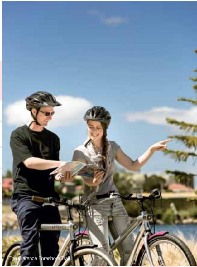
The Clarence Foreshore Trail