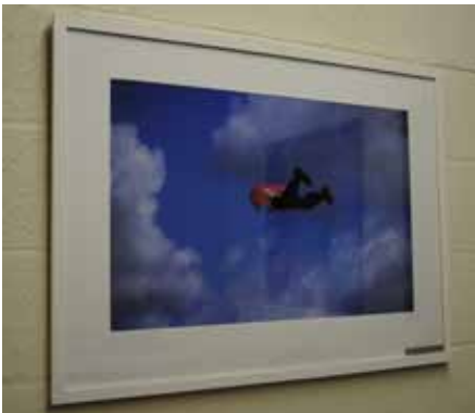
VAN RIET, Caroline Lucy in the Sky - Kite Festival, Wentworth Park Photograph 61 x 82 2004 Acquired 2004