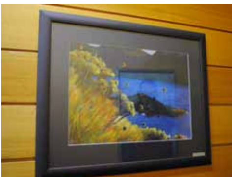
MEECH, Sue The Last Rays of '99 Pastel on paper 65 x 80 2004 Acquired 2004