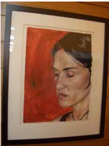
GATES, Rachael Vicki Oil pastel and ink on handmade paper 107 x 88 2006 Acquired 2006