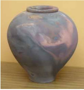
POWELL, Billie Vessel Ceramic vessel Wood fired ceramic 29cm tall x 23cm diameter 1994 Acquired 1994