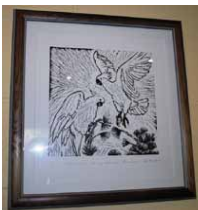
BURROWS, Lola Cockatoos on a stormy afternoon, Bundanon Lino print 48x48 1999 Acquired 2002