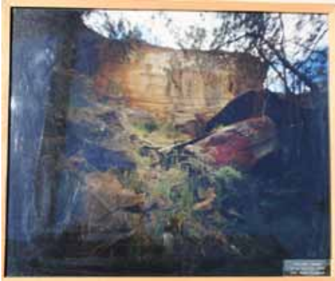
MELVILLE, Troy Waverly Quarry Photograph, colour 53x63 1993 Acquired 1994