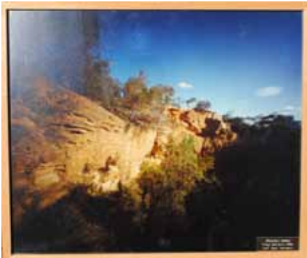
MELVILLE, Troy Waverly Quarry Photograph, colour 53x63 50x60 1993 Acquired 1994