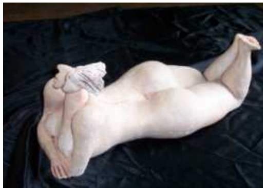
CURRY, Sally Woman with Bird Mask Ceramic sculpture 16 tall x 41 long Acquired 1994