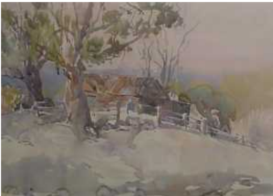
HUDSON, Lindy Waiting For the Rain, Downham's Road, Grass Tree Hill Painting, watercolour 79x96 1995 Acquired 1995