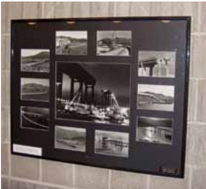
STEPHENS, Donald History of Bridging the Derwent Photography, B & W 74x94 1997 Acquired 1997