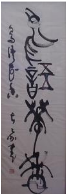
DAWO, Zhang Birds Sing Among Fragrant Flowers. Impressions of Clarence Calligraphy, Ink on paper 113x37.5 Date unknown Gift to Council