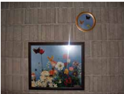
CUPIT, Rose The Garden Photography, colour 55x65 & 25 round 1994 Acquired 1994