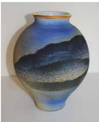
KNIGHT, Mark Landscape Vase Ceramic 25 tall 17 diameter Date unknown