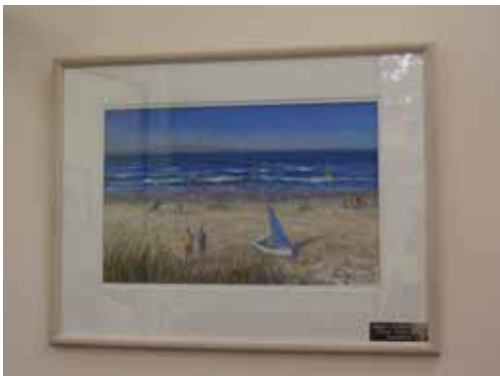
WALTER, Knoop Summer at Clifton Beach Drawing, pastel 49 x 64 2000 Acquired 2000