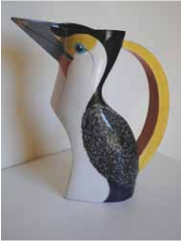
OAKFORD, Dawn Pied Cormorant Jug Ceramic 30 tall 1999 Acquired 1999