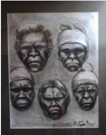
GLOVER, Elizabeth The People of Oyster Cove subtitled The Exile Drawing, charcoal 70 x 58 1988 Donated 2004