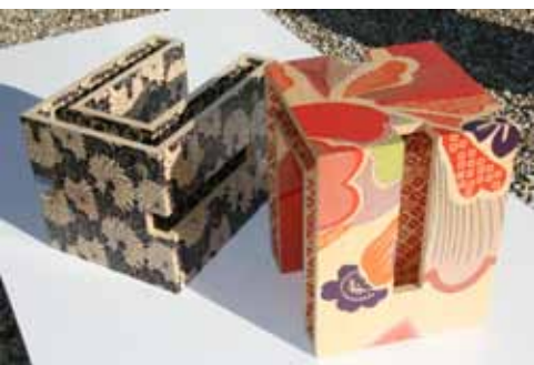
UENO, Fukotoshi Dress Code Furniture - birch with screenprint (design by Akira Isogawa) 47 h x 36 w x 36 d 2009 Acquired 2009