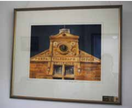
POOL, Ted Century's End - Seconds to Y2K Painting, Watercolour 58 x 69 1999 Acquired 1999