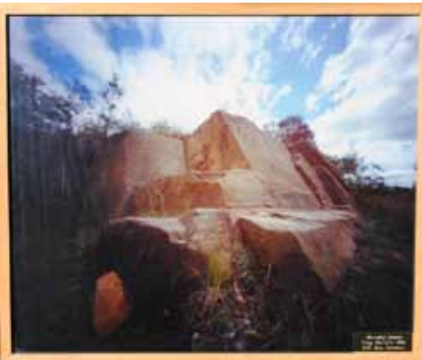
MELVILLE, Troy Waverly Quarry Photograph, colour 53x63 1993 Acquired 1994