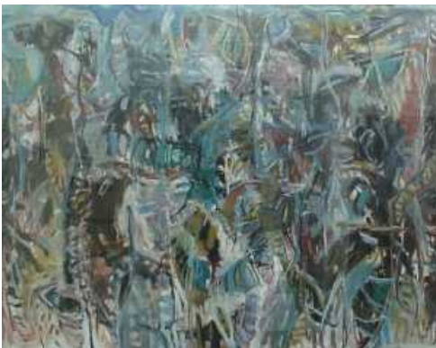
WESTBURY, Paul Maria Summer IV Drawing, Mixed Media 108x128 1990 Acquired 1990