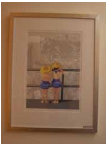
McATEER, Margaret Twins 2003 Screenprint 80 x 65 2003 Acquired 2004