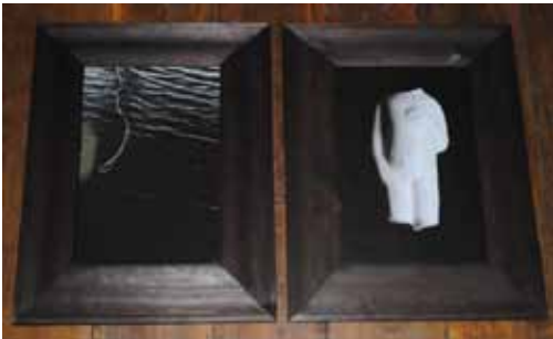
CROFT, Fiona Seven Elegies - Archaeological series based on Rosny Farm Photography Sizes variable 1995 Commissioned 1995