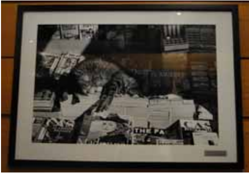
METZLER, Brigette Siesta, Barcelona Photograph, B&W 54 x 75 2000 Acquired 2001