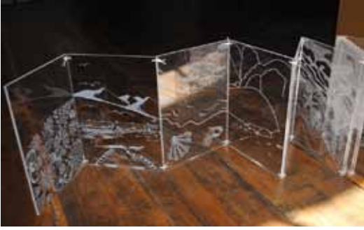
Caligraphy Society of Tasmania Coastlines Etched acrylic concertina book 21 x 15 each x 12 pages 2005 Donated