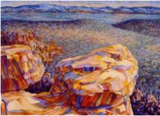
BURDON, Christina East Views West Painting, watercolour and gouache 76x96 1997 Acquired 1997