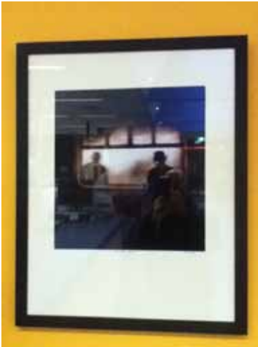
MOSS, Ron Midnight Passing Digital photography 76 x 60 2012 Acquired 2012