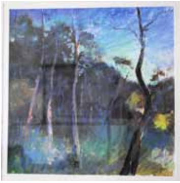
YOUNG, Jenny Bush at Randall's Bay Mixed media 53 x 53 2011/12 Acquired 2012