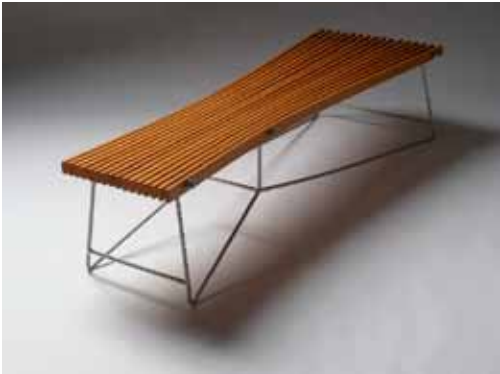
BROWN, Sally Warp Bench Furniture - stainless steel, celery top pine & pvc 40 h x 175 w x 60 d 2007 Acquired 2007