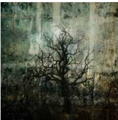
RUFFELS, Troy Sentinel, from Filtered Sky series 2009 Archival solvent based print on aluminium sheet with backing frame 120x120cm 2009 Acquired 2010