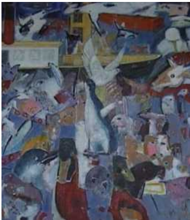
BODEN, Anthea Noah Boards the Reemere, Ark Series Painting, oil in canvas 118x105 1997 Acquired 1997