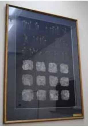
AUSTIN, Eleanor Daisy a day Textile, Embroidery 101x77 1988 Acquired 1988