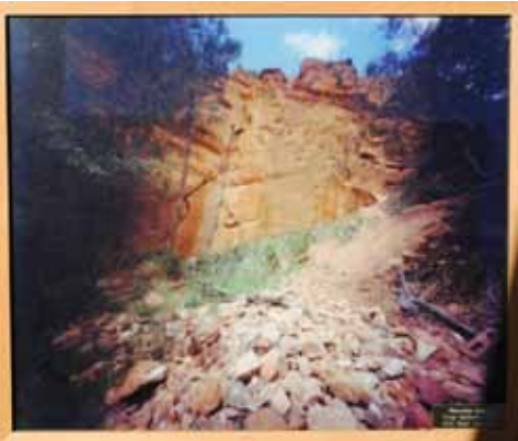
MELVILLE, Troy Waverly Quarry Photograph, colour 53x63 1993 Acquired 1994