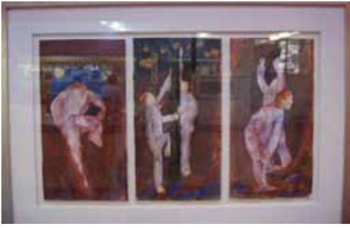
NOLAN, Betty Knowledge Mixed media 65 x 80 2004 Acquired 2004