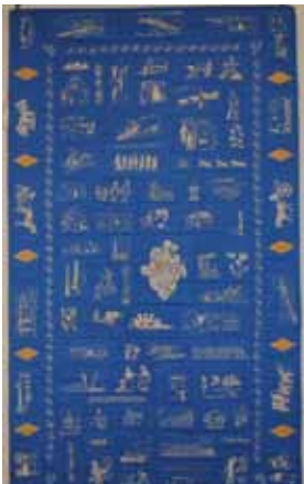
SAGES The Clarence Quilt Textile quilt 174 x 84 2004 Donated 2006