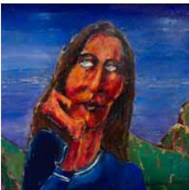
GREGG, Garry Woman in Landscape Painting, Acrylic 127 x 127 2000 Donated 2004