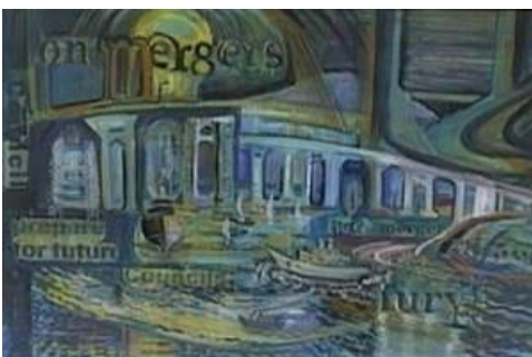
CASIMATY, Diane On Mergers Collage, mixed media 57.5x74 1997 Acquired 1997