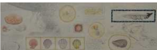
TONKS, Angela Beachcombing at South Arm Painting, watercolour 39x83 1990 Acquired 1990