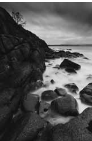
SHELLEY, Samuel Seven Mile Digital photography 115 x 83 2011 Acquired 2011