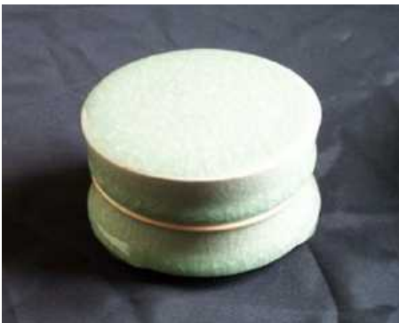
RICHARDSON, Ben Lidded jar Ceramic 6.5 tall x 11 diameter 1994 Acquired 1994