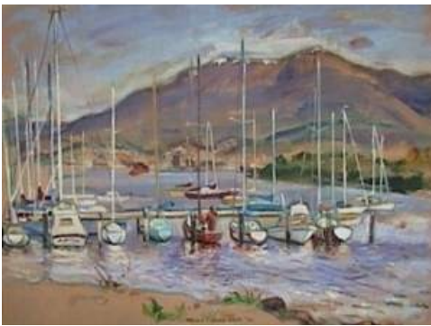
TURNER SMITH, Patricia Boats - Bellerive Painting, oil on canvas 52x68 1992 Acquired 1992