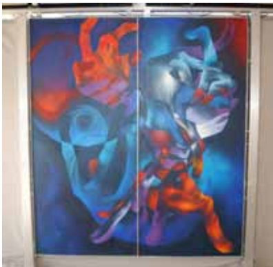
HOWLETT, Aedan Untitled Spray paint on canvas 210 x 93 each 2011 Commissioned 2011