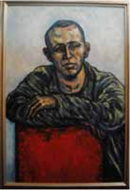
RODWELL, Caz (Carol) Modern Boy - Matt 1999 Oil Painting 100 x 70 1999 Acquired 1999