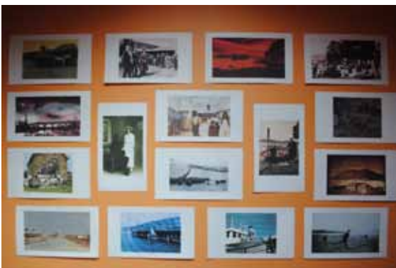
Hunter Island Press Historical Art Digital prints 56.5 x 33 each x 71 prints 2010 Donated 2010