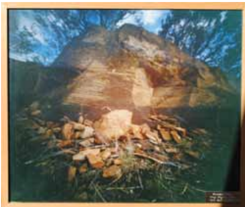
MELVILLE, Troy Waverly Quarry Photograph, colour 53x63 1993 Acquired 1994