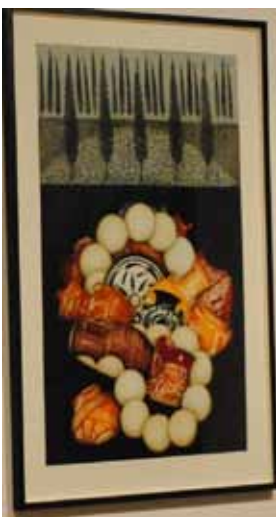
WOODROFFE, Katy Treasure Island: Pearl Necklace I Printmaking 141 x 95 2001 Acquired 2014