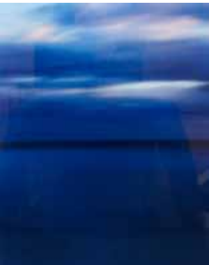
CURTIS, Anthony Eternal Light Photograph, type C colour 69 x 57 2001 Acquired 2001