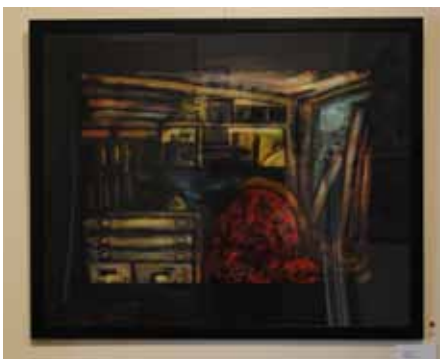
Maya Studio at Dusk Watercolour 96 x 78 2010 Acquired 2010