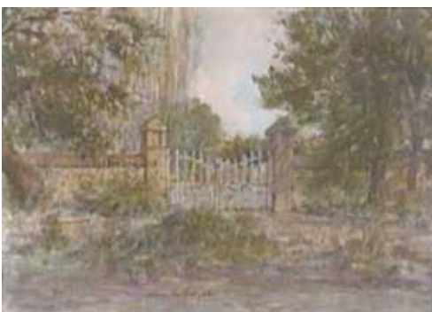
McINTYRE, Alan Gate at Woolmers Painting, watercolour 53.5x63 1990 Acquired 1990