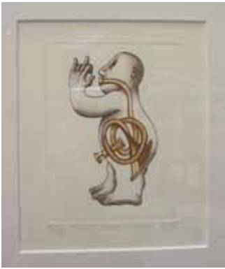
SAMEK, Tom Music From Within Etching, hand coloured 39 x 33 Date unknown Acquired 2006