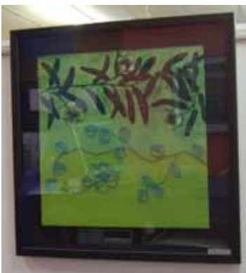
ROSE, Rachael Untitled Collograph 76 x 75 2004 Acquired 2004