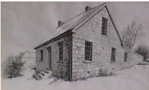
BLUNDEN, Christine Rosny Cottage Drawing, ink 48x67 1988 Acquired 1988