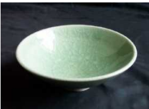
RICHARDSON, Ben Bowl Ceramic 7 tall x 19 diameter 1994 Acquired 1994