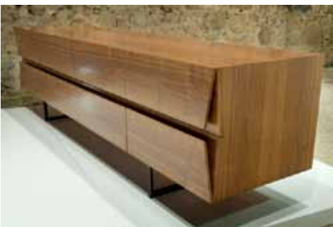
ANCHER, Simon Clipped Wing Bench Furniture - American walnut, powder coated steel and marine ply 68 h x 240 w x 52 d 2011 Acquired 2011