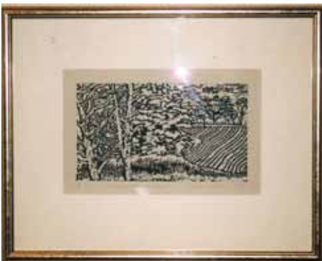
BURDON, Christina Campania House Landscape Lino print 39 x 49 1999 Acquired 1999