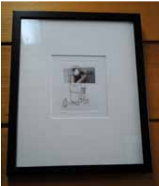
SAMEK, Tom Untitled (roobs trumpet) Etching, hand coloured 39 x 33 Date unknown Acquired 2006