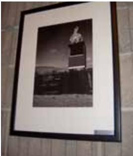
WALKER, David Hamilton Landscape Photograph, B&W 57 x 45 2001 Acquired 2001