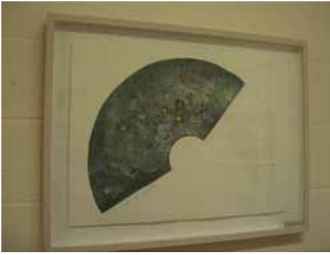
DE SALIS, Pippa We Shall Be Friends Collograph 59 x 77 2004 Acquired 2004