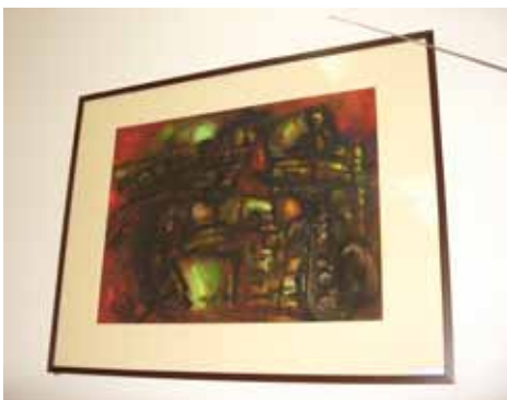
MAYA Jazz at the Quay Painting, ink 81 x 104 2004 Acquired 2004