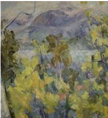
KNIGHT, Winifred Wattle in August Painting, oil on flax 85x80 1992 Acquired 1992