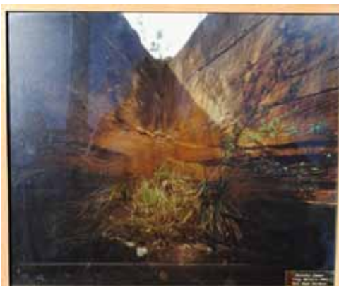
MELVILLE, Troy Waverly Quarry Photograph, colour 53x63 1993 Acquired 1994