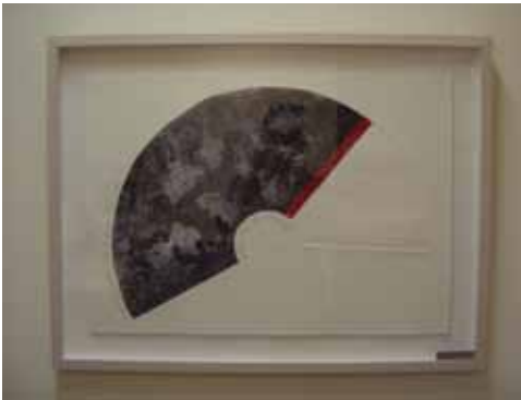
DE SALIS, Pippa Meet Me at Midnight Collograph 59 x 77 2004 Acquired 2004