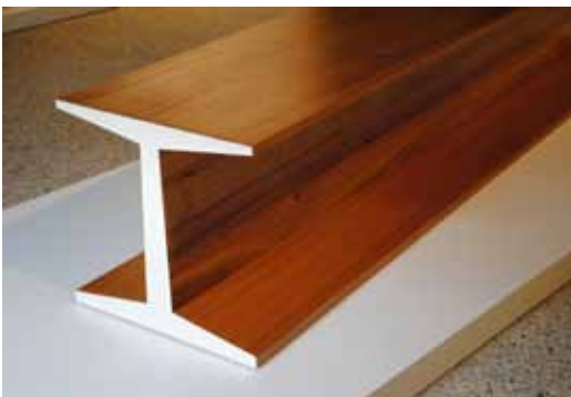
MCCUSKER, Laura I Beam Bench Furniture - Tasmanian Oak 45 h x 45 w x 249 l 2013 Acquired 2013