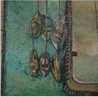
HIND, Greg Wharfside Hobart Painting, oil on canvas 84x84 1990 Acquired 1990