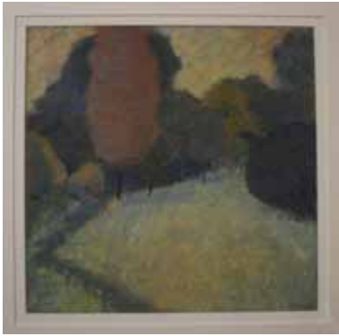
YOUNG, Brian Bush track at Tarooma Pastel on paper 53 x 52 2010 Acquired 2010