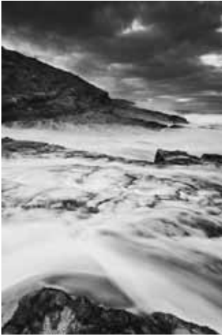
SHELLEY, Samuel North Goats 2 Digital photography 115 x 83 2011 Acquired 2011