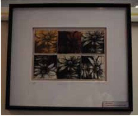
DAVIDSON, Louise Emergence Etching 35 x 30 2006 Acquired 2006