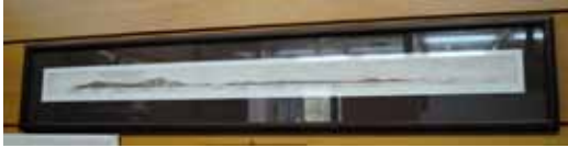
TITCHEN, Allison Landfall Copper plate etching 102 x 20 1999 Acquired 2000