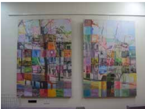
CLARENCE PENCILLERS Boardwalk Colours Drawing x 2 150 x 115 each 2004 Acquired 2004