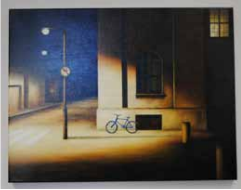
SPENCER, Gaye Blue Bicycle Oil on canvas 53 x 42 2010 Acquired 2010