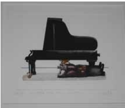
SAMEK, Tom Under the Influence Etching, hand coloured 39 x 33 Date unknown Acquired 2006