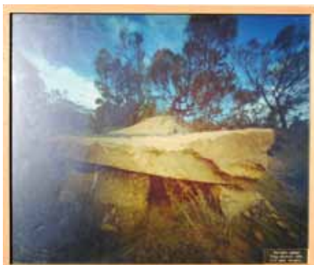
MELVILLE, Troy Waverly Quarry Photograph, colour 53x63 50x60 1993 Acquired 1994