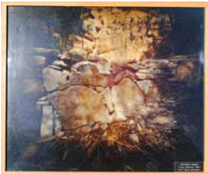
MELVILLE, Troy Waverly Quarry Photograph, colour 53x63 50x60 1993 Acquired 1994