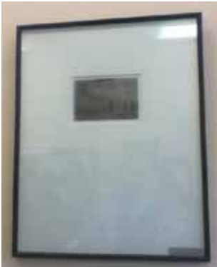
PARKINSON, Richard The Gates Photograph, Bromoil 53 x 42 2001 Acquired 2001