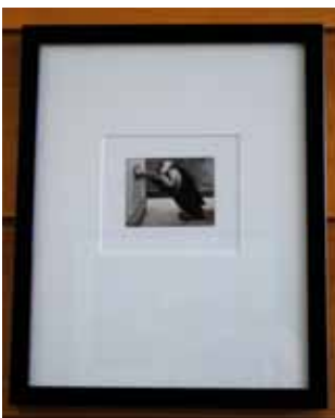
SAMEK, Tom Untitled (trumpet against the wall) Etching, hand coloured 39 x 33 Date unknown Acquired 2006