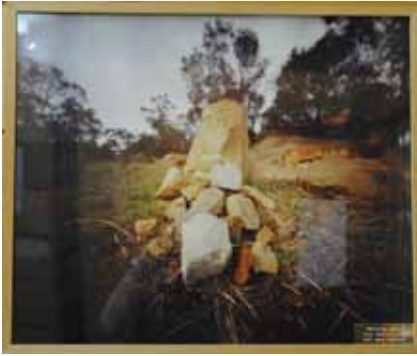
MELVILLE, Troy Waverly Quarry Photograph, colour 53x63 1993 Acquired 1994