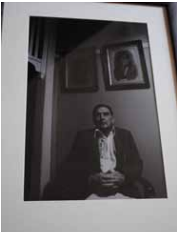
CROFT, Fiona Morgan's Run Photograph, B & W 56.5x45 1994 Acquired 1994